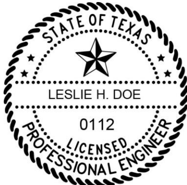
Figure: 22 TAC §137.31(c)